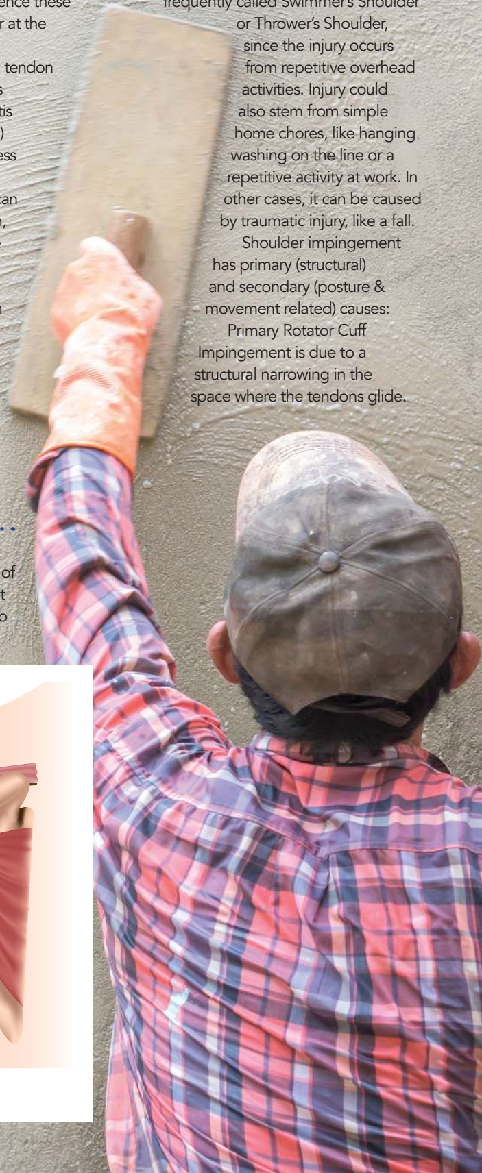
Rotator cuff problems